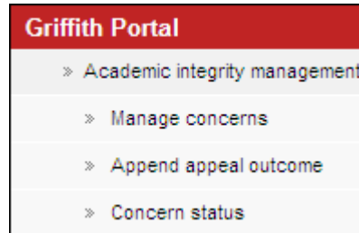
Figure 2 Navigation items

After accessing the system via the Griffith portal the following navigation items are displayed. Descriptions of the navigation items are provided in the following table.