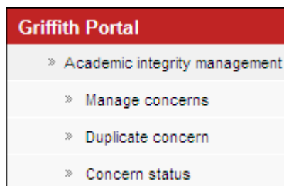
Figure 2 Navigation items

After accessing the system via the Griffith portal the following navigation items are displayed. Descriptions of the navigation items are provided in the following table.